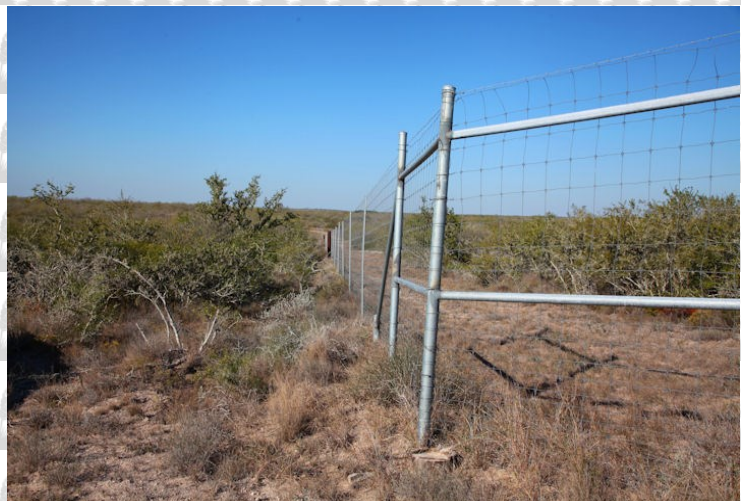
The property is high-fenced on three sides.