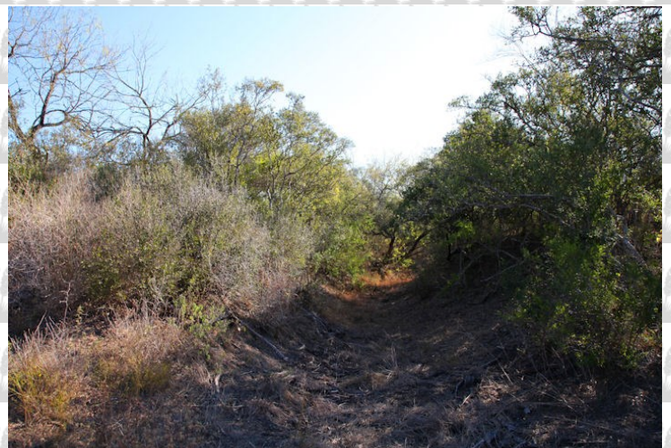
A dry creek bed bisects the property and boasts the majority of the largest trees on the ranch.