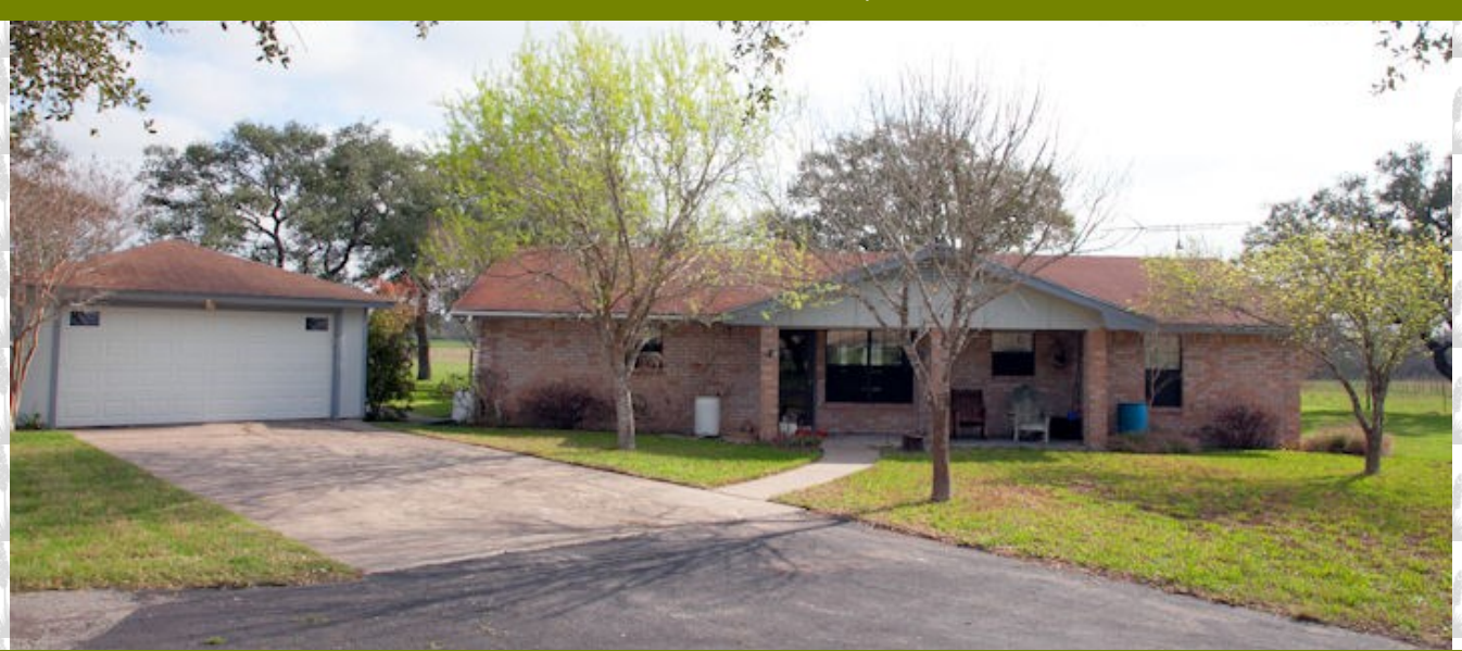
326 FM 1203, Beeville, Texas

For more information, please view www.desertflowerrealty.com